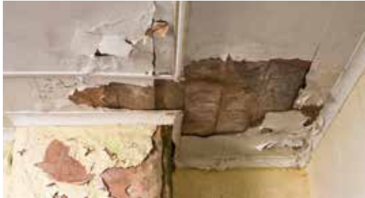
Porous and prone to water absorption, having adverse effect on durability of the concrete