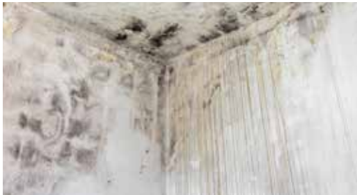
Dampness fosters the growth of mold and mildew while also diminishing the structural durability