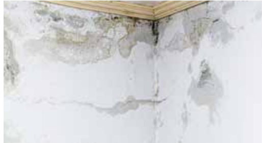
Waterproof coating protects concrete but deteriorates under UV exposure and temperature fluctuations, increasing the risk of water seepage