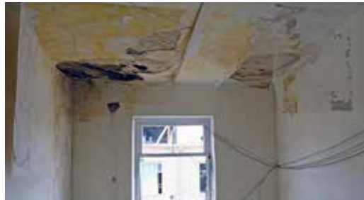
Dampness can lead to aesthetic problems

Concrete Uno concrete is water repellent in nature. Concrete Uno properties inhibit water from getting absorbed inside the surface. With the virtue of advanced innovation in mix design of Concrete Uno, capillary absorption is further reduced & surface water absorption is negligible as compared to the standard concrete, Which does not allow water passage in the concrete structures.