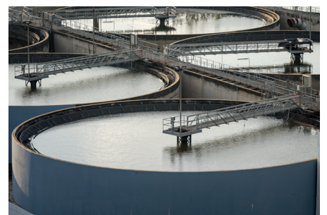
Water and Sewage Treatment Plants