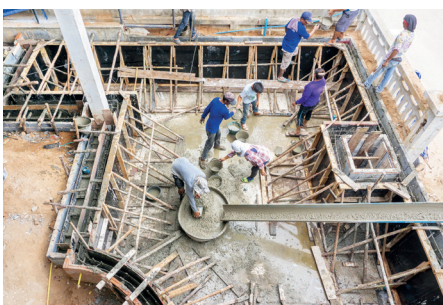
“Water Retaining Structures/Swimming pool