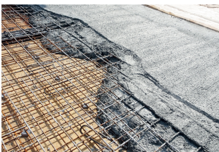
Floor & Roof Slabs